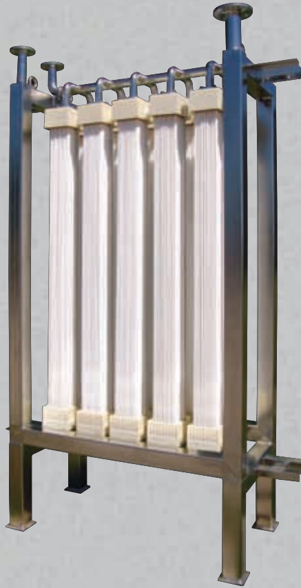
MBRs are available in a variety of configurations for both new construction and system retrofits.

Chemically resistant POREFLON is stable against all acids, alkaline solutions, oxidizers and solvents with a pH tolerance of 0-14. POREFLON can be used in harsh applications and survives rigorous cleaning cycles, for full restoration of membrane performance. This MBR will outperform and outlast the competition, especially in harsh environments.